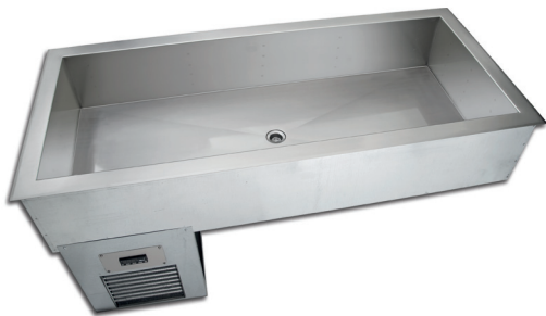
Top: Cooling trough for containers according to the catering industry standard (Gastro-Norm), ready-to-plug-in, with cooling machine (unit), with transportation lock